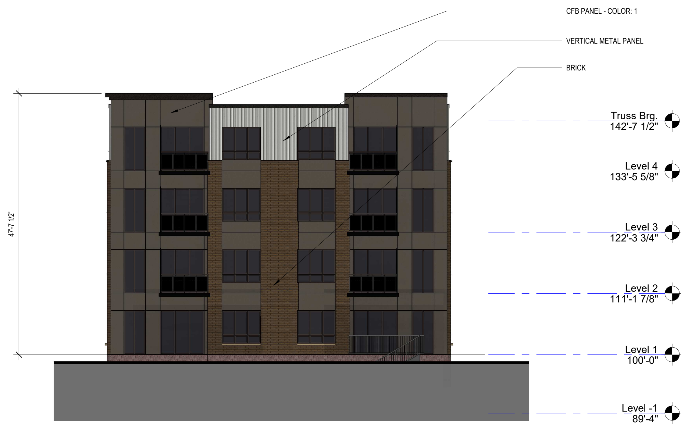
2 NORTH ELEVATION 3/32" = 1'-0"