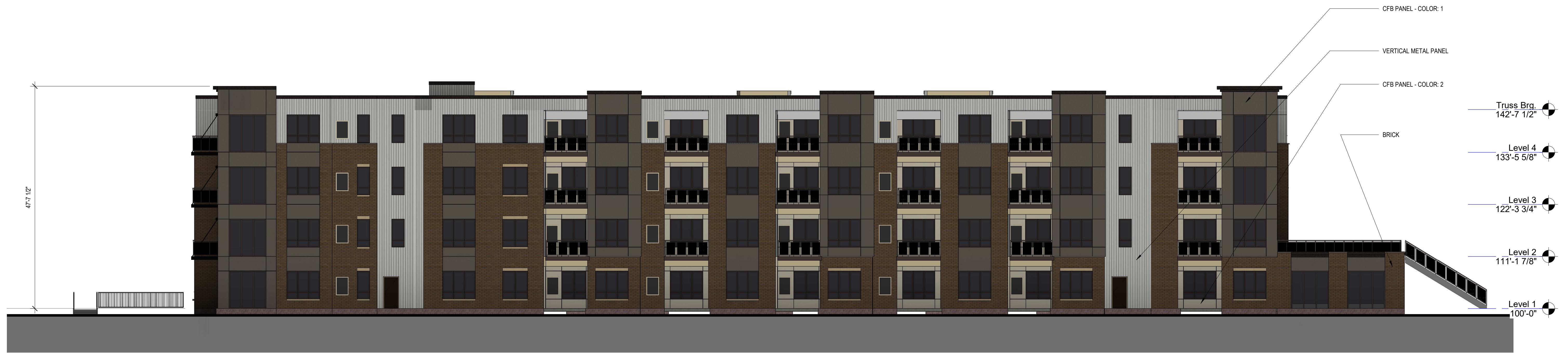
1 WEST ELEVATION 3/32" = 1'-0"