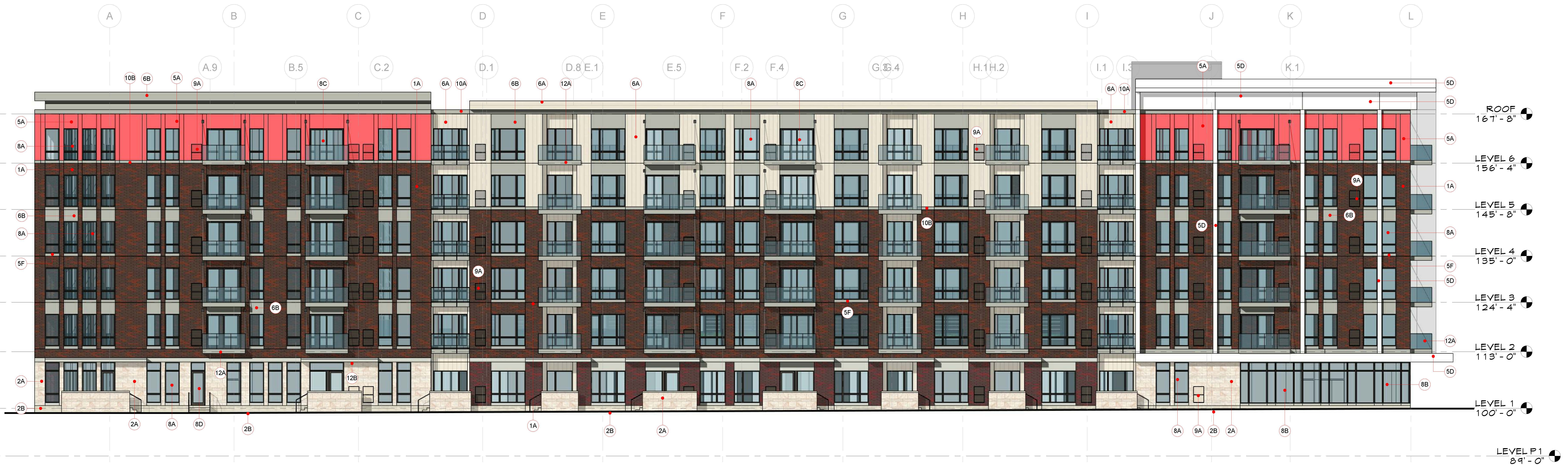
2 PH2- WEST ELEVATION PH2 A3.1 3/32" = 1'-0"