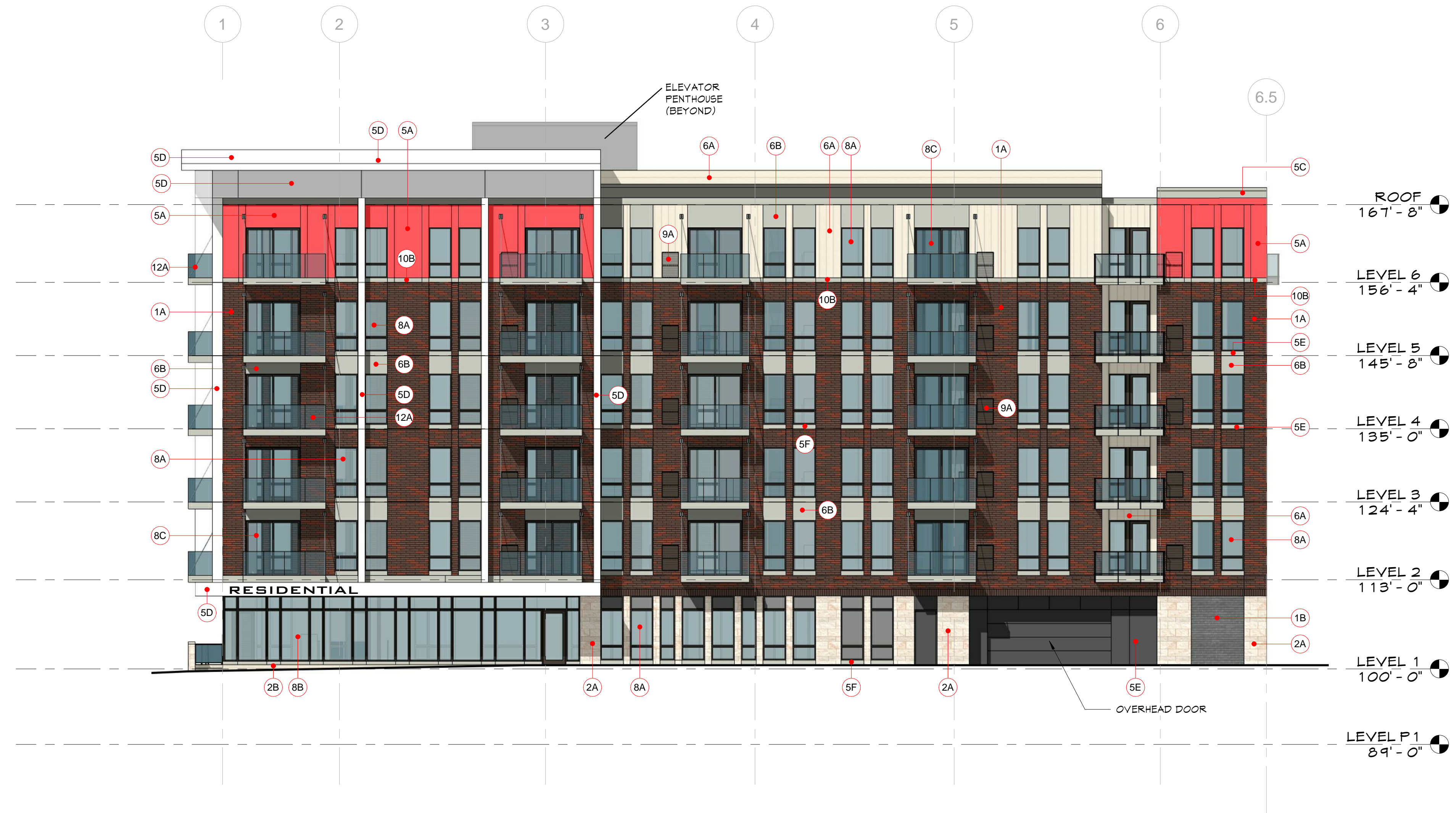
1 PH2- SOUTH ELEVATION PH2 A3.1 3/32" = 1'-0"

NOTE: FINAL PROPOSED BUILDING SIGNAGE TO BE DETERMINED AND MADE PART OF FUTURE CITY SUBMISSION FOR APPROVAL.