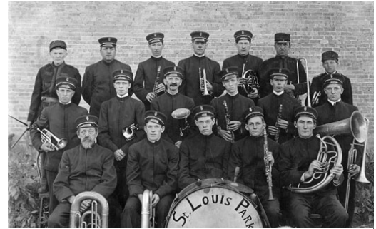
The St. Louis Park Village Band in 1903