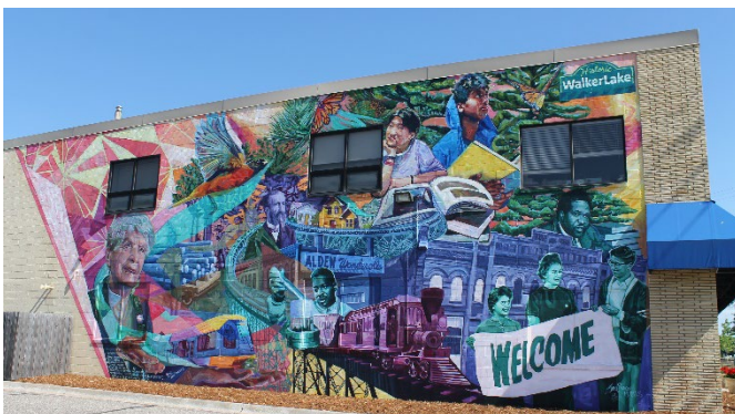
The Historic Walker Lake community mural, created by GoodSpace Murals

This framework explores key priorities identified as critical to building on current assets and strengths, honoring the community's desire for participatory, dispersed arts and culture opportunities that connect, enliven, and improve the wellbeing of our community. The vision suggests a model in which these three core areas of development are all continuously informed and tested through the lenses or questions: Are our ideas guided by a commitment to embrace equity and inclusion? Are our ideas amplified by proactive efforts to build awareness of arts and culture, as well as recognition of a unique civic identity? Are our ideas sustained through policy and resource commitment?