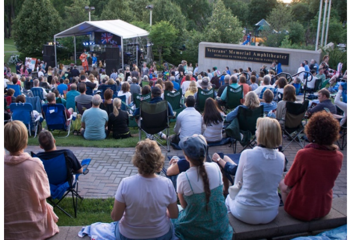
Summer concert series at the Wolfe Park Veterans Memorial Amphitheater

The breadth of programs and broad support for the arts by Friends of the Arts and the city is a result, in large part, of advocates from the community and within city government, and the strong relationships that have formed. To ensure the long-term stability of arts and culture in the community, the city and Friends of the Arts are working together to determine where efforts should be focused, how to express and communicate its importance to community vitality, and building cross-sector support and partnerships. Guided by the knowledge that arts and culture are a key contributor to economic and community development, this framework will enshrine past efforts and offer a strategic path to approach arts and culture as a tool in solving community challenges and developing policy on which the future of arts and culture in St. Louis Park will grow.