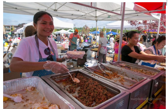
The inaugural Thai Street Food Festival