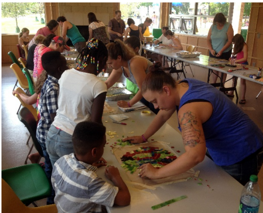
Community participants create a mandala for the '100 Hands Mosaic' public artwork

Focus on creativity and the arts as important vehicles to strengthen and improve community health and wellbeing through programs and projects that support mental health, encourage active lifestyles, support sustainable greenspace—creative opportunities encouraging healthy minds, healthy bodies, and a healthy natural world.