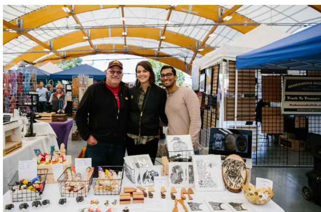
The inaugural St. Louis Park Art Fair at the ROC, 2018

This activity is made possible by the voters of Minnesota through a grant from the Metropolitan Regional Arts Council, thanks to a legislative appropriation from the arts and cultural heritage fund.