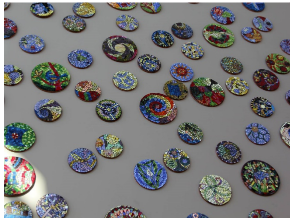
The '100 Hands Mosaic' permanent installation at the West End Showplace Icon Theater