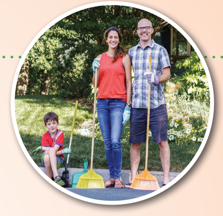
Adopt a storm drain: 288 participants, 517 adoptions