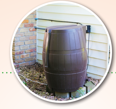
Sold 161 rain barrels