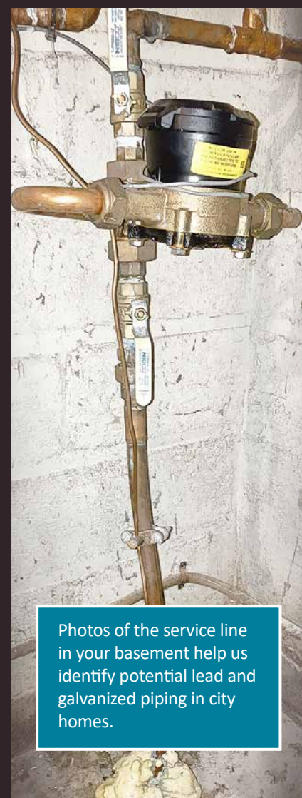
Photos of the service line in your basement help us identify potential lead and galvanized piping in city homes.

St. Louis Park provides high-quality drinking water that meets and exceeds EPA action levels for lead and copper. Visit www.stlouisparkmn.gov/water-sewer for more.