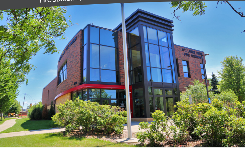
Fire Station 1, 3750 Wooddale Ave. S., St. Louis Park, MN